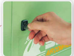
Quick Lift-off Door 快拆式板金