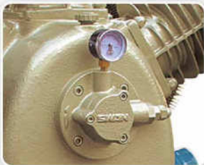
Enforced Oil Lubricating System 強制潤滑機構