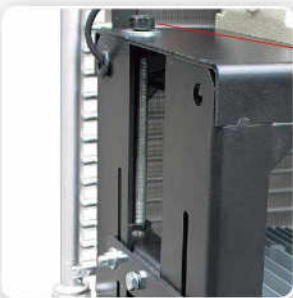
Adjustable Belt-tension Mechanism 皮帶調整器