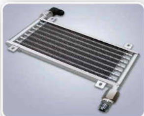
After Cooler 後部冷卻器